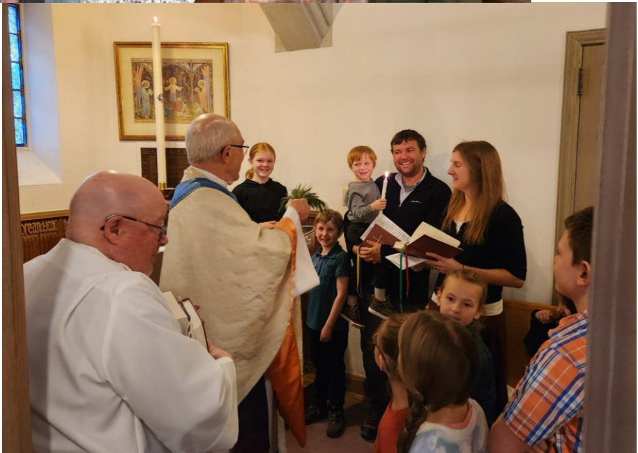
Pictured: (Top) A member’s Discernment Committee. (Bottom left) Togendowagan Society community meal. (Bottom right) Baptism.