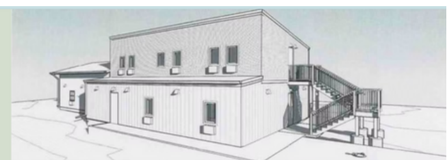
Progress: December 2025

Our 14-room overnight shelter construction is well underway. Family Promise is seeking partners for construction funding, programming and operations support. Their plan is to be serving those in need by Spring of 2026. Please contact them if you are interested in helping achieve this goal with your time, treasure, and talent.